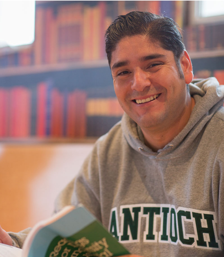
PHOTO: Students in the Master's in Clinical Psychology Program at Antioch University, Santa Barbara have the option to participate in a Latino Mental Health concentration.