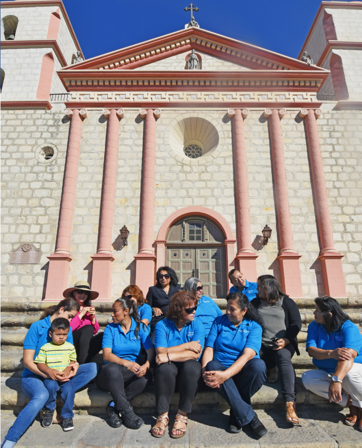
PHOTO: The Promotores are a group of men and women with extensive knowledge of available community resources.