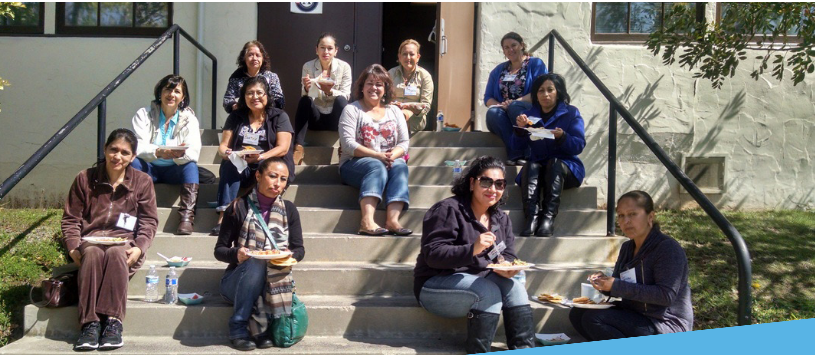
PHOTO: Promotores, like those pictured below, are dedicated to assisting residents who face language barriers when seeking access to healthcare.