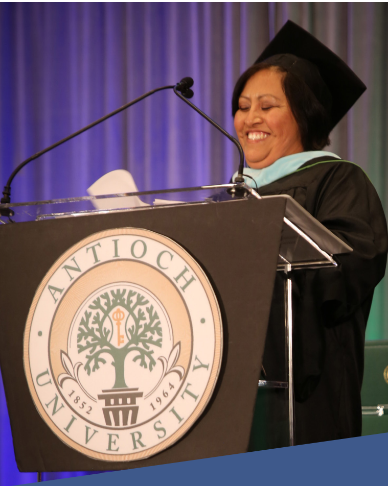
PHOTO: Local service providers like CALM serve a majority Latinx client-base, and they employ many qualified bilingual and bicultural mental health practitioners to meet this need.

To learn more about the Behavioral Health Grant Program (as well as the Foundation's other Grant Programs), visit the Grant Opportunities page on our website.