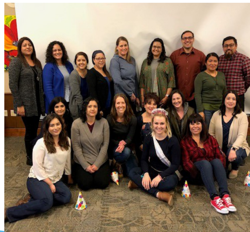
PHOTO: CALM’s staff based out of their Santa Maria office, pictured here, work to prevent, identify and treat childhood trauma in North County.

Core Support for Basic Needs grant in 2017 and Early Care and Education grant in 2018, and they have utilized this funding to increase and improve behavioral health services in North County. CALM currently has 40 staff members based out of the Lompoc and Santa Maria offices, serving all of North County, including the cities of Santa Ynez, Guadalupe, and Cuyama. While the organization has made great strides in North County, they aspire to be doing much more. For instance, CALM has behavioral health professionals embedded in 22 preschool and afterschool sites in Santa Barbara County, but only one of those sites – the Santa Maria Valley YMCA – is located in North County.