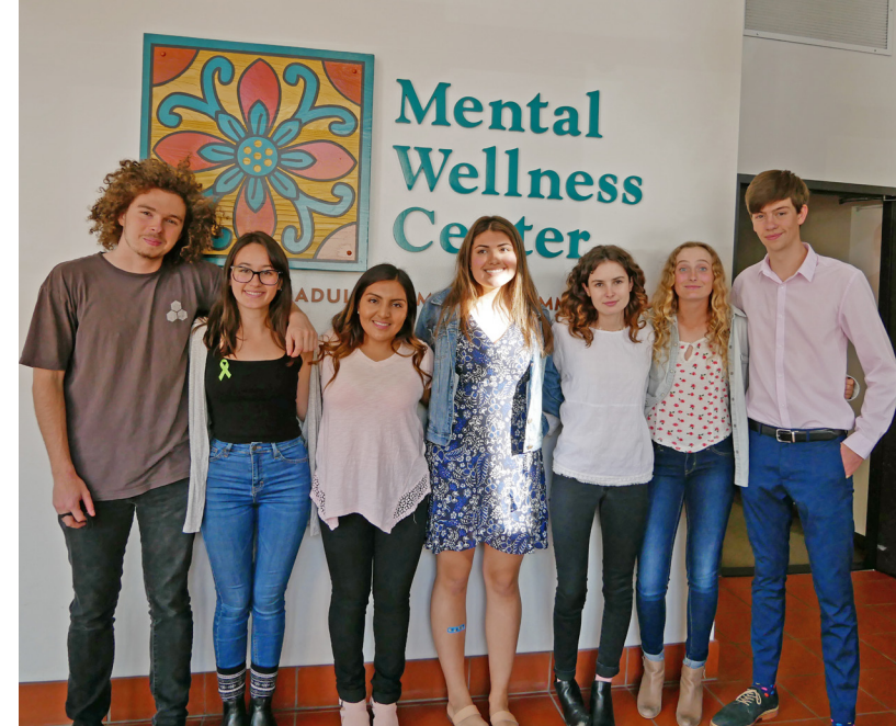
PHOTO: Class of 2018 graduating seniors from the Mental Wellness Center's Youth Wellness Connection Council.

To address this issue, MWC is once again partnering