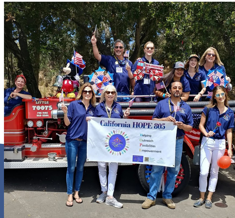
PHOTO: The California Hope 805 team at Montecito 4th of July Community Celebration.

“There has been a greater sensitivity and appreciation in the community,” she said. “Even if someone wasn’t personally impacted, they have empathy for others who have been. And that’s important – a major challenge in this work is getting people to understand others when they can’t physically see the effects of mental trauma.”